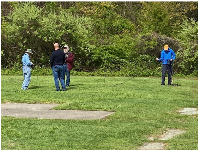
Antenna Set Up