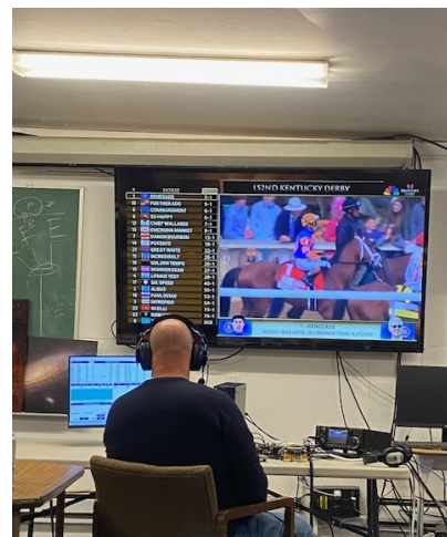
What to watch? The bands or the KY Derby?