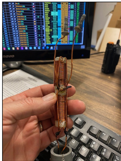
Burned coil from OCF dipole